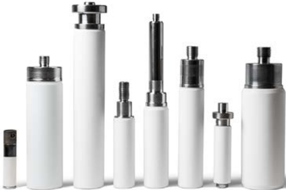
CoorsTek ceramic plungers