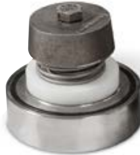
Abrasion resistant valve