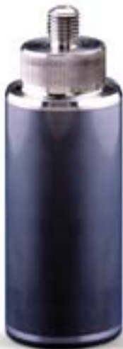
Tungsten carbide plunger

Made with the same material and process as our Hard-Co plungers.