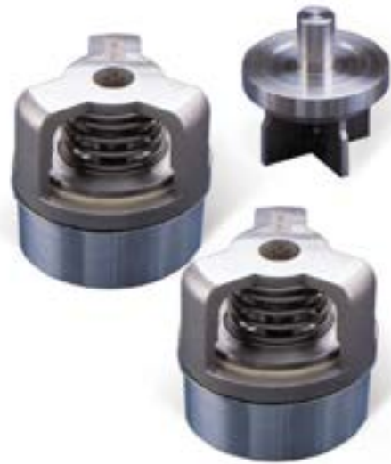
Abrasion resistant valves

Optional packing materials — Additional sizes and materials including style 255 Teflon®, assorted styles of Kevlar® fibers, spring-load packing and split-ring, die-formed sets are available upon request.