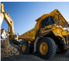
EQUIPMENT & MACHINERY