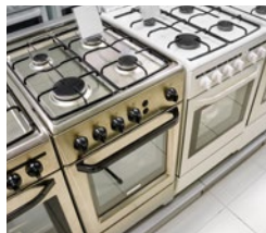
CONSUMER & HOUSEHOLD