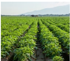
FOOD & AGRICULTURE