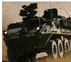
DEFENSE & SECURITY